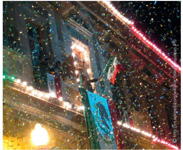
Municipal president giving the "Grito" of "Viva Mexico" at the commencement of Independence Day festivities in Mexico.